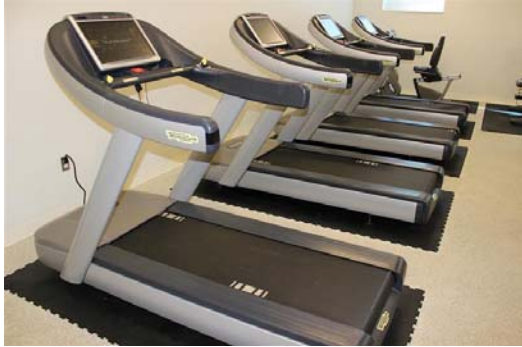
Excite Unity™ Treadmill (4)