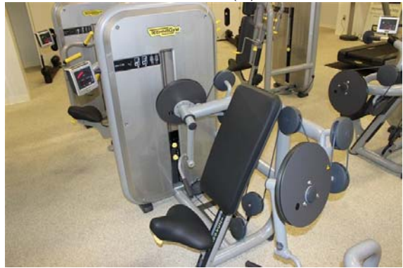
Element + Arm Curl (1)