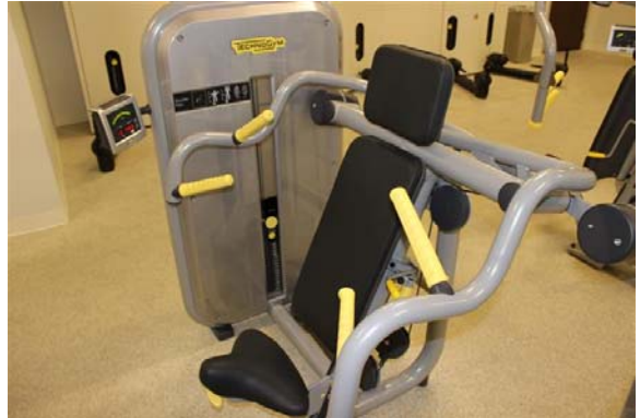
Element + Inclusive Shoulder Press (1)