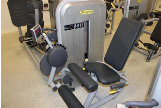
Element + Inclusive Leg Extension (1)