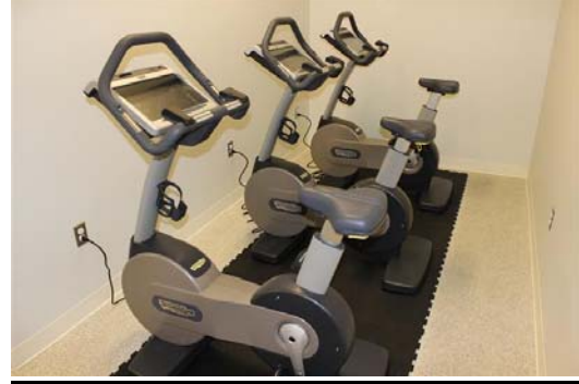
Excite Bike 700 Stationary Bike (3)