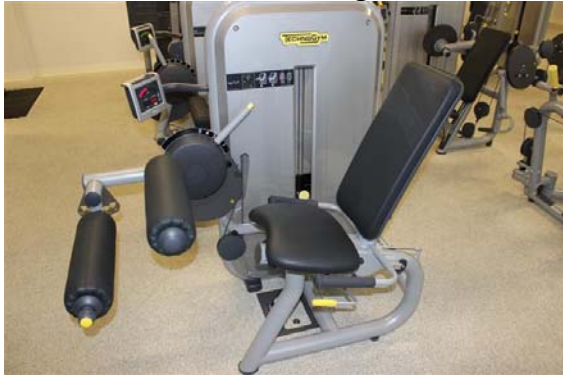
Element + Inclusive Leg Curl (1)